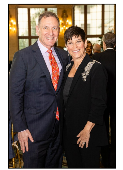
BUILDING BRIDGES BY BREAKING BREAD Ogether