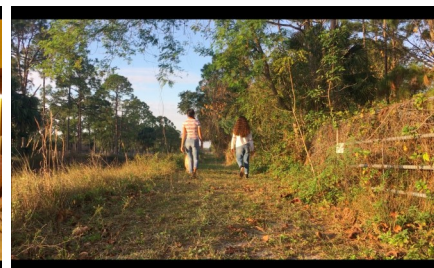
selected frames from video by Tess Romine